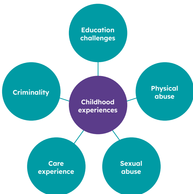
Figure 2: Childhood experiences highlighted by ex-service personnel in CJS in this research.