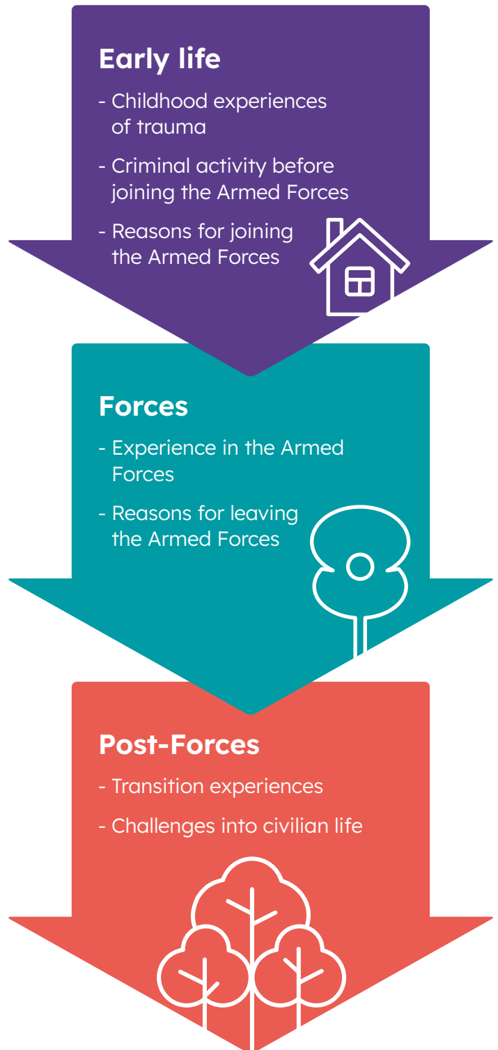
Figure 1: Thematic overview of life pre-CJS

In addition to ex-service personnel, the team also interviewed 71 stakeholders to shed light on their experiences of working with ex-service personnel who have been in contact with the CJS. This report is organised into three sections: early life; experience in the Armed Forces; and post-forces transitions and experiences. Key themes and issues are presented within each section. Information on the methodological approach for the research can be found in the main report (Singh, et al. , 2024). Figure 1 provides a thematic overview of the report with the key sub-sections outlined.